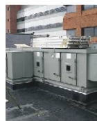
Air Handling Units