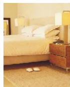
Hotels and Hospitals