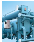
Hot Water Fired Chillers