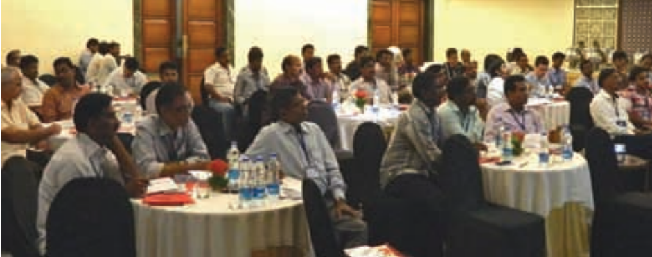
Participants at a session : energy saving techniques

C&H Services SBU organised training programmes in Chennai, Bangalore and Hyderabad for its customers on 'Energy saving opportunities in Industries'. 250 participants were trained on steam engineering, energy conservation and monitoring techniques.