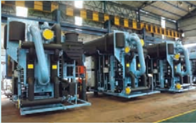
Chillers at Lego's plant: using waste heat for cooling

Over the last decade Thermax has installed more than 450 vapour absorption chillers in US and Europe, which have the biggest co-generation markets in the world.