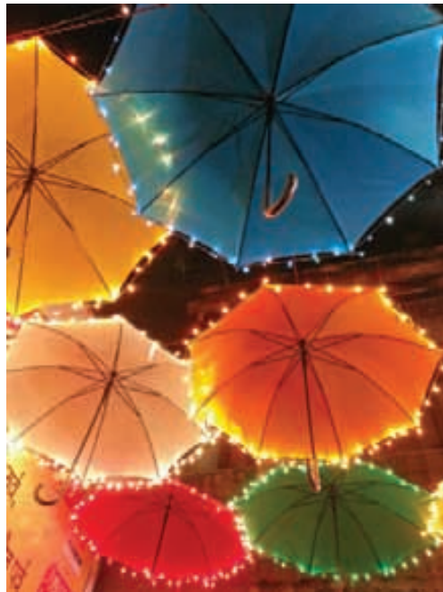
Radiant umbrellas shot at Pune's Tulsibaug market during Ganesh Chaturthi time.