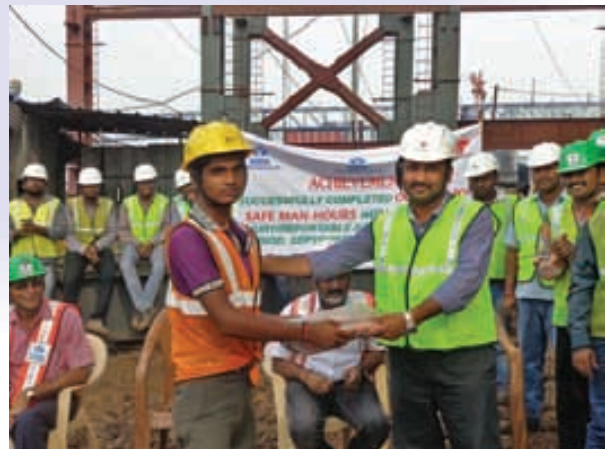
Felicitating Therman team at the Tata Power work-site : safe man-hours

Grasim felicitated the Therman projects team for completing seven million man-hours free from loss due to injury (LTI- lost time injury) at its Bharuch site where a 3X32 MW captive power plant is being commissioned. The trophy and letter of appreciation awarded to the MPP Group of the Power Division group recognises the robust safety standards and practices at the worksite of Therman's management, staff, contract workmen and Grasim's HSE team.