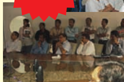
Badly lit, composed