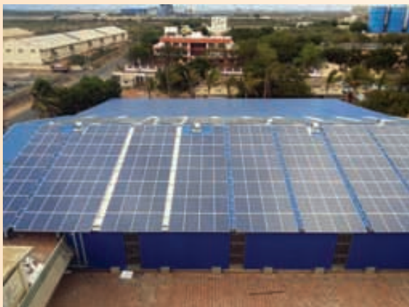
100 kW solar power plant : new possibilities for industry

The B&H Services team of Uday Nair, Tirupati Polaswar and Chandan Peela was behind this commendable indigenisation project.