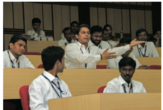
A discussion underway : ideas galore

The technical discussions covered electrical and instrumentation, critical mechanical equipment, and soft skills like