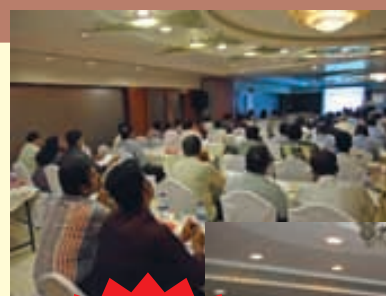
All backs, no faces