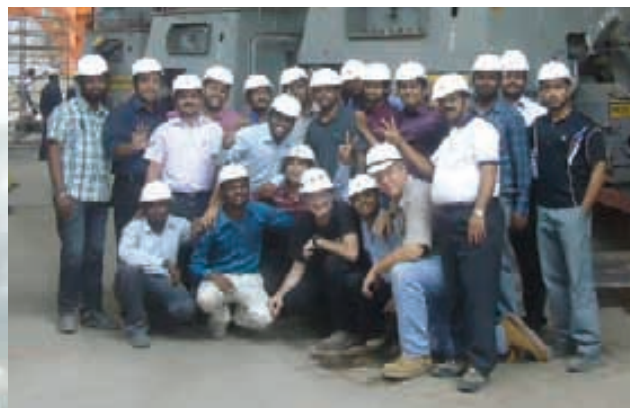
Coal fired boilers at the refinery; and an elated Thermax Utility SBU and B&W team after the commissioning : game changer in petrochemicals