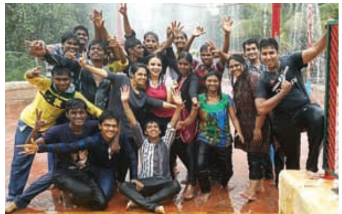
Rain dancing : young at Thermax

The 18 Diploma Engineer Trainees (DETs) were welcomed to Thermax in July with an intensive induction at EERC. During the month long programme, they met divisional heads, trained on specific products, brushed up engineering concepts, attended behavioural programmes such as Campus to Corporate transition and visited manufacturing plants.