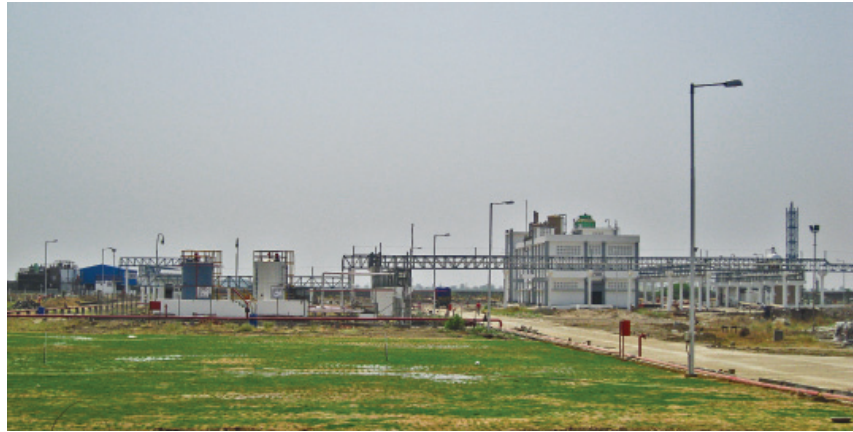
Jhagadia plant : supporting the surge in infrastructure activity

T hermax recently began manufacturing construction chemicals at its state-of-the-art facility in Jhagadia, Gujarat. This follows the technology transfer agreement it signed with Tecnochem Italiana SpA, Italy. These specialty chemicals when added to cement and concrete, reduce energy consumption, improve efficiency of the manufacturing process, reduce water consumption and substitute environmentally harmful additives like fly ash.