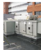
Air Handling Units