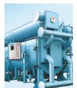
Hot Water Fired Chillers

For more information, please get in touch with your nearest Thermax representative. You can also mail us at SteamEngineering@thermaxglobal.com or visit us at : www.thermaxglobal.com .