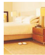
Hotels and Hospitals